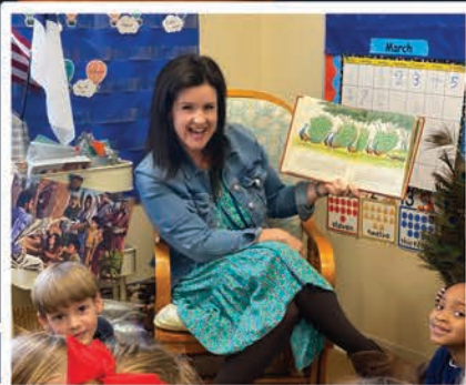
THE VALUE OF A FIRM FOUNDATION