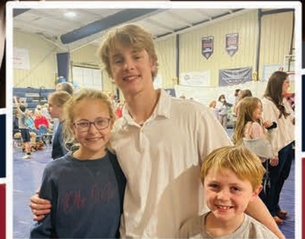
MAC GIVES BACK